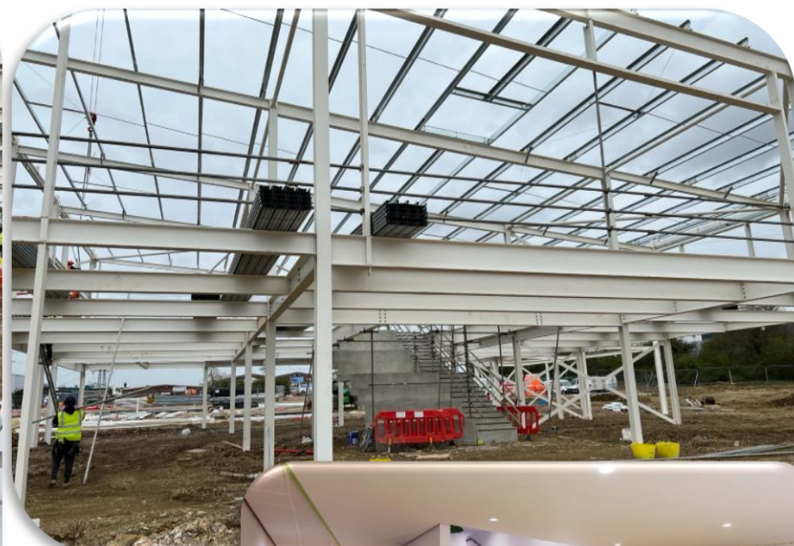
The steps will provide seating areas for outbreak lessons in the large communal areas.