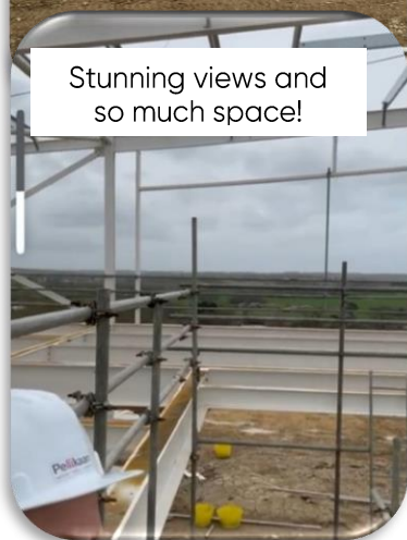
Stunning views and so much space!