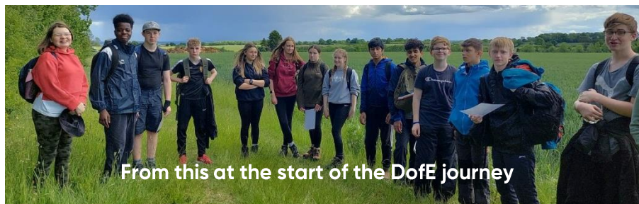
From this at the start of the DofE journey