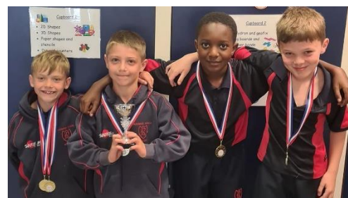
Pictured: Year 4 ISA Group Team Event Winners.