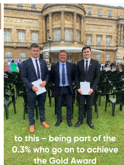
to this – being part of the 0.3% who go on to achieve the Gold Award